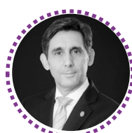
Jose María Álvarez-Pallete