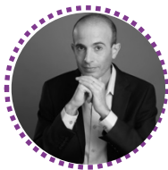
Yuval Noah Harari

First Deputy Mayor for Economy, Labor, Competitiveness and Finance, Barcelona City Hall