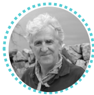
Juan Luis Arsuaga